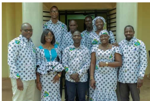
The CapDH team.